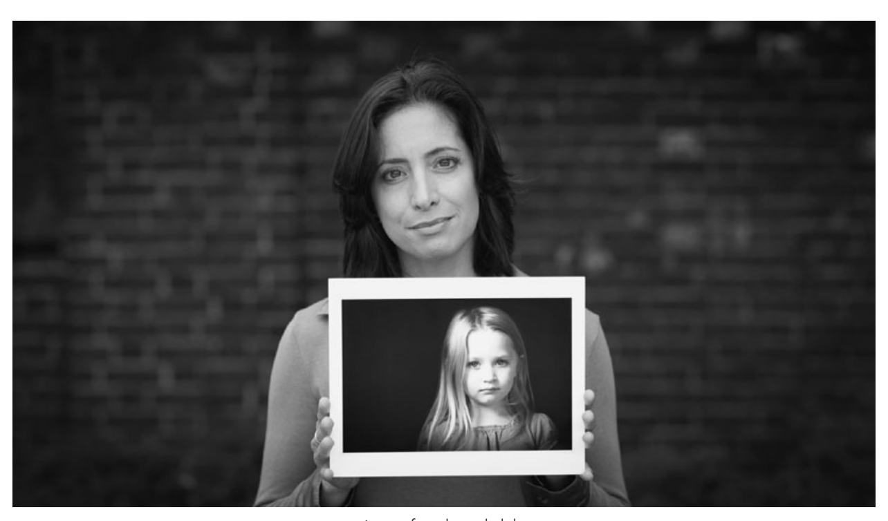
I am for the child.

"I would take my kids to different places they have never been."