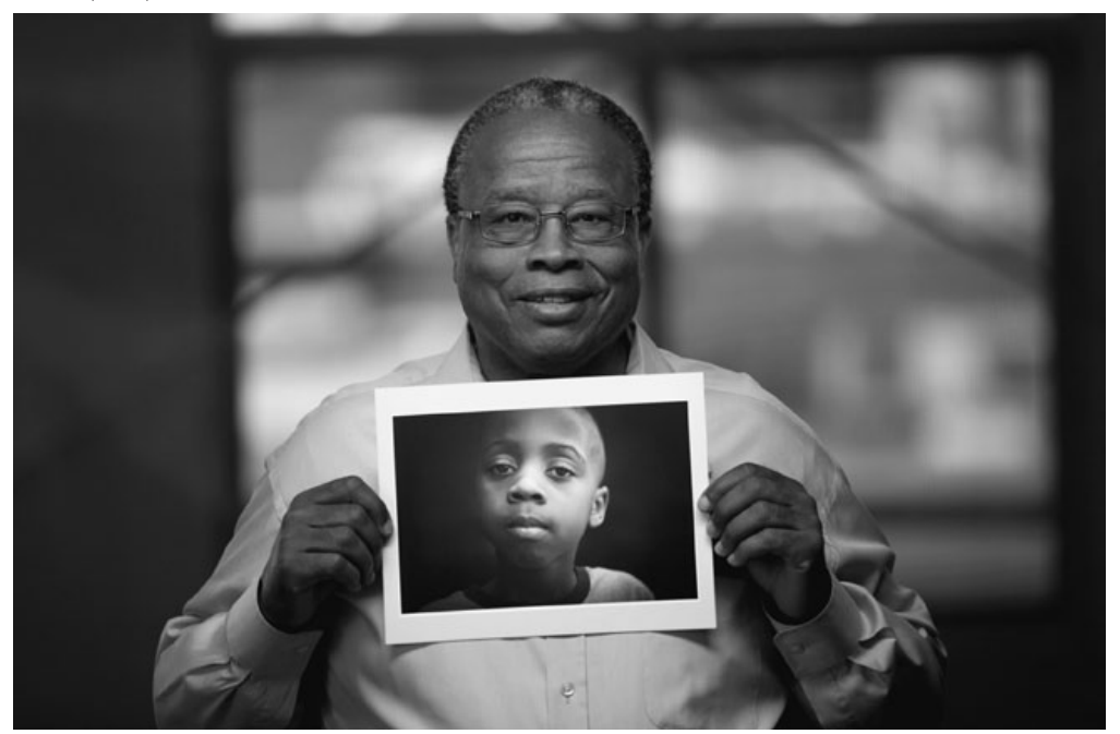
I am for the child.

The children/youth participating in these conversations seemed to picture their GAL volunteer as a friend, mentor, counselor, teacher, advocate, supporter, and cheerleader. This Initiative realizes two outcomes: (1) it documents the success of the Guardian ad Litem Program and the work of its volunteers and (2) it also provides the opportunity for children in foster care to guide the direction of the Guardian ad Litem Program and to improve the organization's ability to meet the child(ren)'s needs.